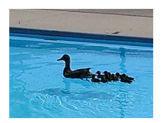
Ducks and Frogs have been among those enjoying the Summerlakes pool this year!